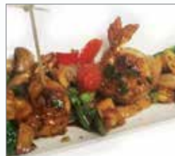
Special Wok Garlic Shrimp