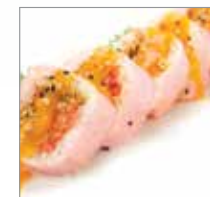
Lady Gaga Roll