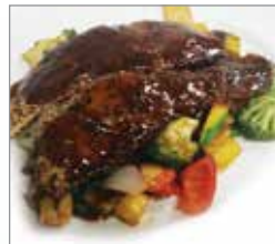
Sesame Crusted Salmon