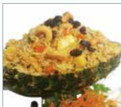
Pineapple Chicken Fried Rice