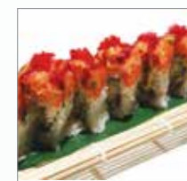
Deluxe Snow Crab Roll