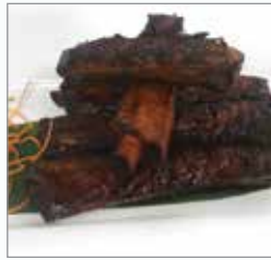
Honey Black Ribs