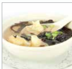
Wonton Seaweed Soup