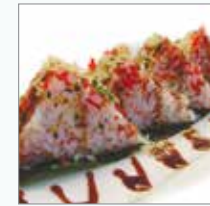
Eel Sandwich Roll