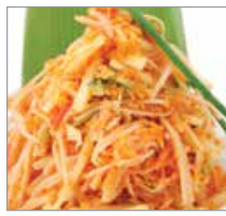
Spicy Kani Salad